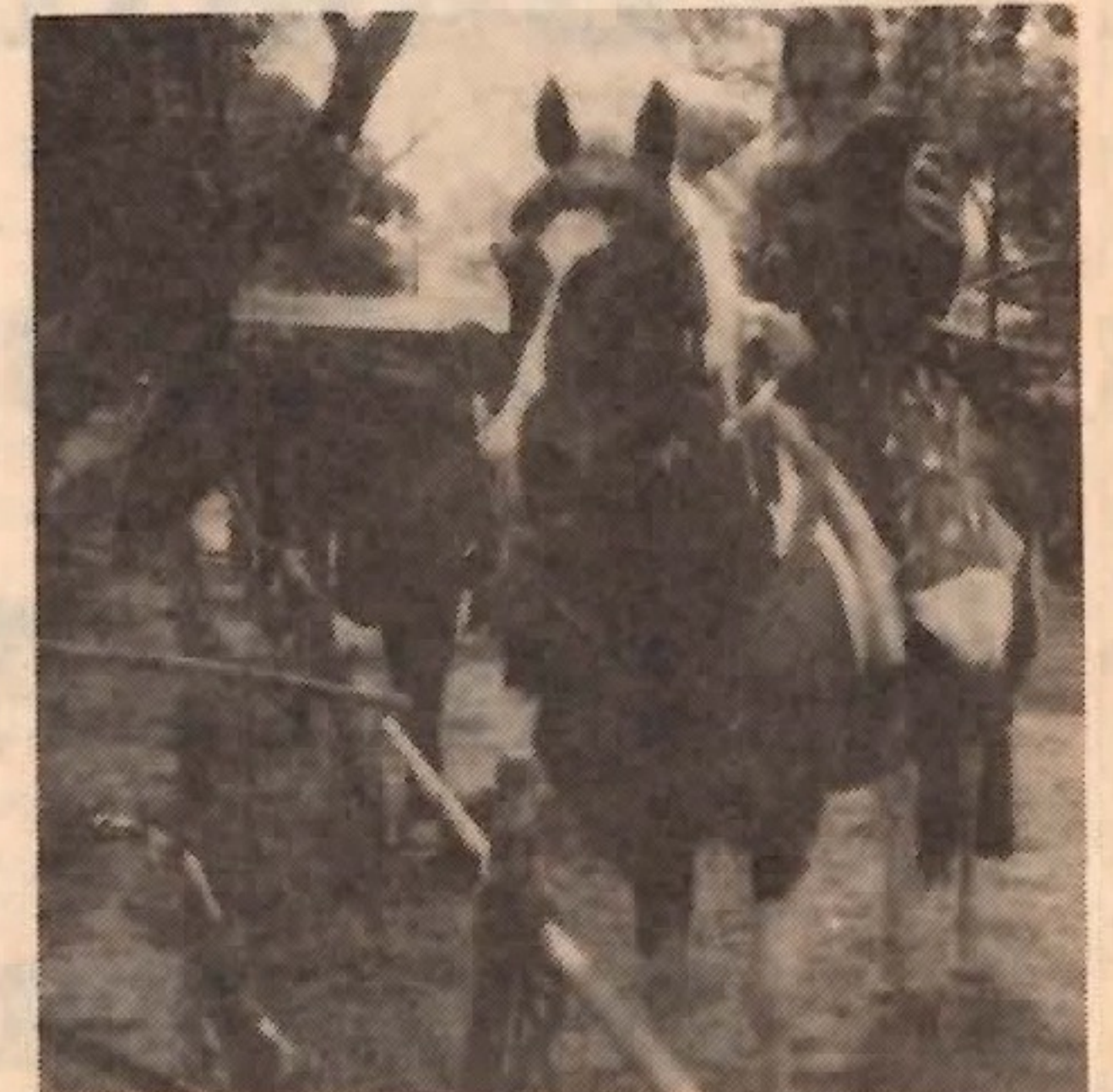
Toshiro Mifune, a star of the mini-series SHOGUN, waits for the contest to begin.

These riders and their horses are known throughout Japan and even the world for their skills. They, and other archers around Japan ride at Hachiman Miura, and when President Reagan came to visit Japan, they performed for him and his wife. Toshiro Mifune was not able to ride for President Reagan because of a bad back, so he has been permitted by