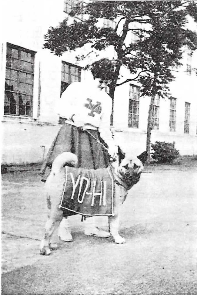
Give a bark for Yo-Hi!!!