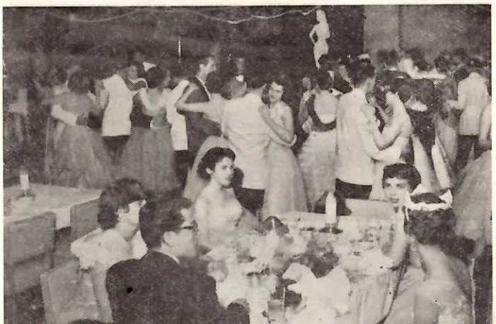
Dancing followed the dinner at the Junior-Senior Prom.