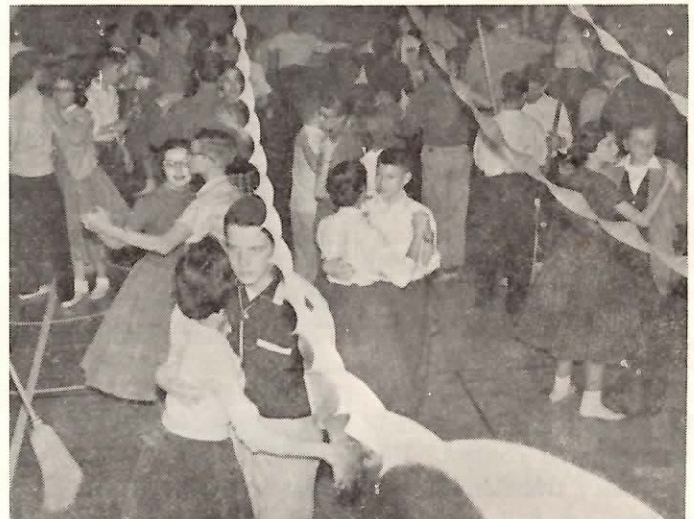
The Freshman Class sponsored the Sham-Rock 'n Roll which was well attended.